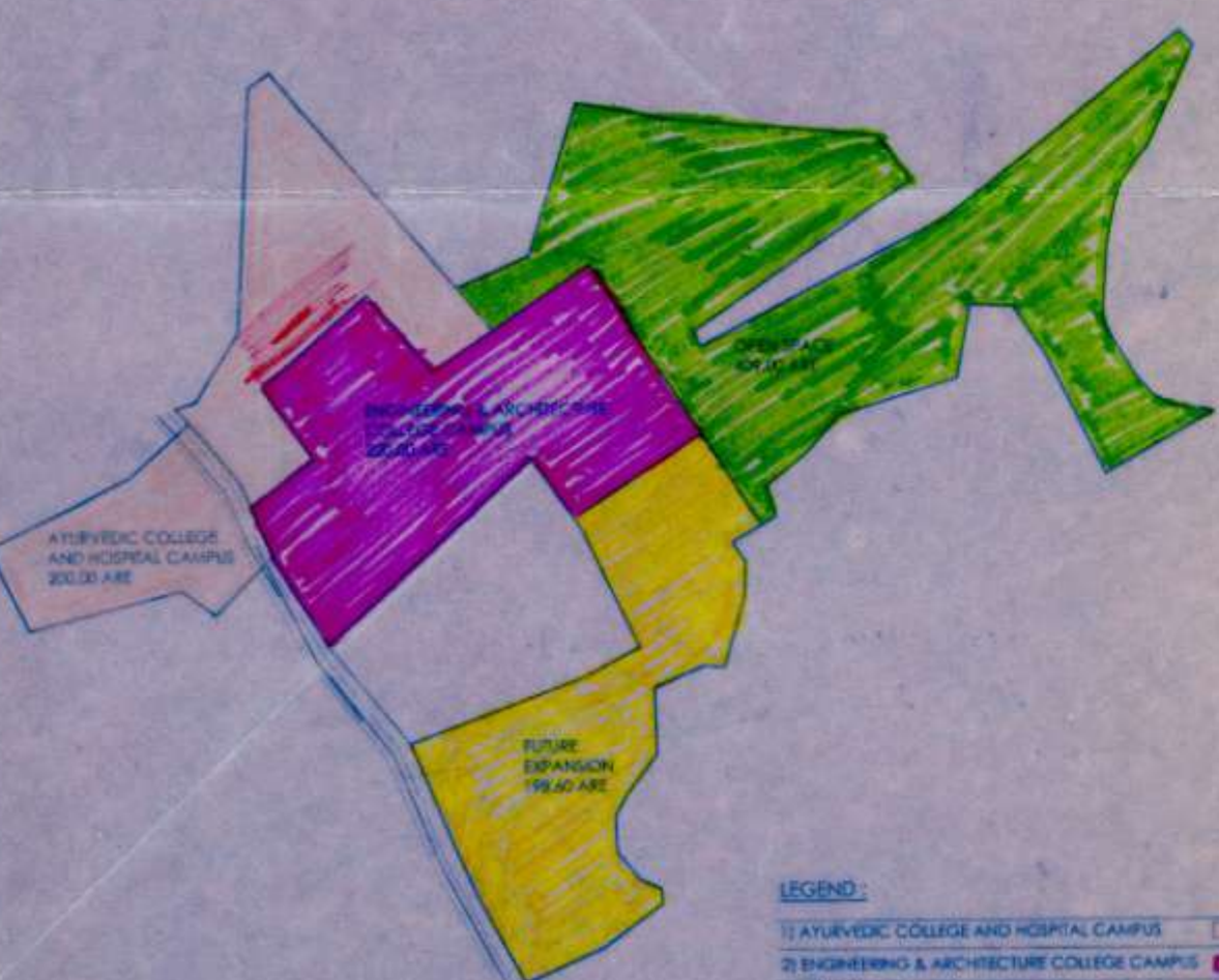
SITE PLAN ZONING SCALE - N.T.S.

LEGEND: 1) ATULVAIDIC COLLEGE AND HOSPITAL CAMPUS 2) BHAMBURDA & ARCHITECTURE COLLEGE CAMPUS 3) OPEN SPACE 4) FUTURE EXPANSION